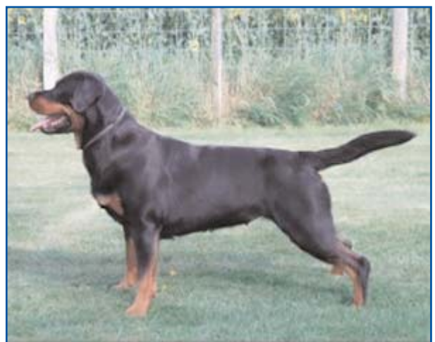
Rottweiler with tail

Tail-docking therefore involves the cutting through or crushing of skin, muscles, up to 7 pairs of nerves and bone and cartilage connections.