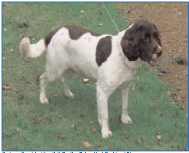
Springer Spaniel with tail

In addition, it has not been demonstrated that tail damage in adult dogs is particularly difficult to treat and that it creates more suffering than the acute, and possibly chronic, pain caused by docking of neonatal dogs.4 The review of tail-docking in 2002 by Defra's Animal Welfare Veterinary Team pointed out that basic first aid would probably be adequate to treat most cases of tail injury.