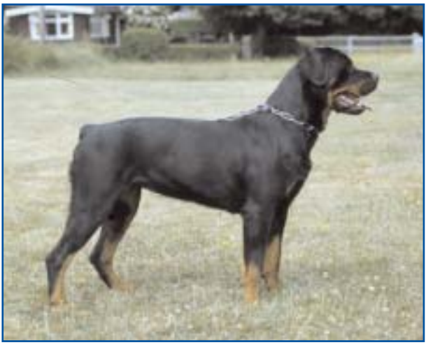
Rottweiler with docked tail