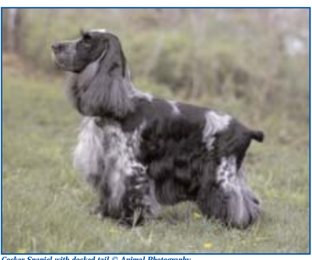
Cocker Spaniel with docked tail

The fact that some breeds of working dog are docked and that other breeds that work in similarly rough terrain are not docked suggests that it is not necessary to dock working dogs' tails to prevent injury and that in reality docking is being carried out for cosmetic reasons. Moreover, most docked dogs are kept as companion animals or as show dogs and there can be no argument for docking their tails.