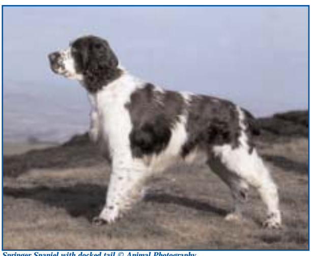
Springer Spaniel with docked tail