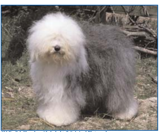
g with docked tail