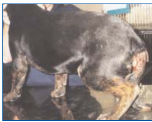
caused by tail-docking in an adult dog