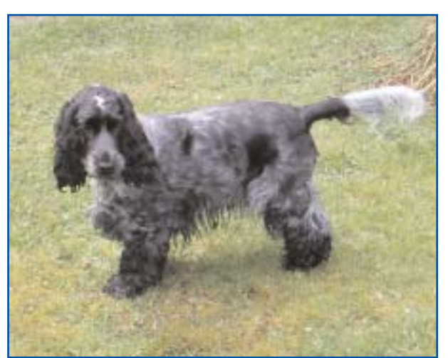
Cocker Spaniel with tail