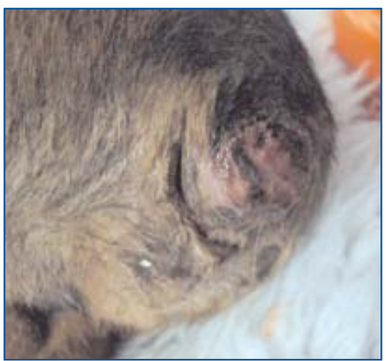
Open wound as a result of home docking

A possible explanation for the belief of some dog breeders that puppies feel negligible pain on docking is that very young puppies may be physically incapable of displaying some of the behaviours that would indicate pain