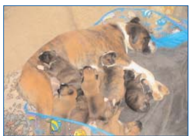
Litter of undocked boxer pups

According to a review of the scientific evidence from Monash University, published in the Australian Veterinary Journal in 2003, 'there are clearly reasonable grounds for arguing that surgical docking causes some amount of acute pain in [lambs, piglets and calves], as does banding, and that either method is also likely to cause pain in other physiologically similar species, such as the dog.' An Australian survey in 1996 found that 76% of the veterinarians surveyed believed that tail-docking caused significant to severe pain in puppies, with none believing that puppies experienced no pain at all<sup>4</sup>.