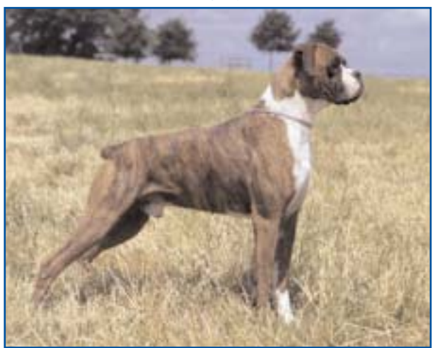
Boxer with docked tail