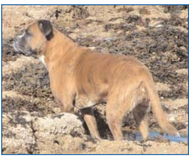
Boxer with tail