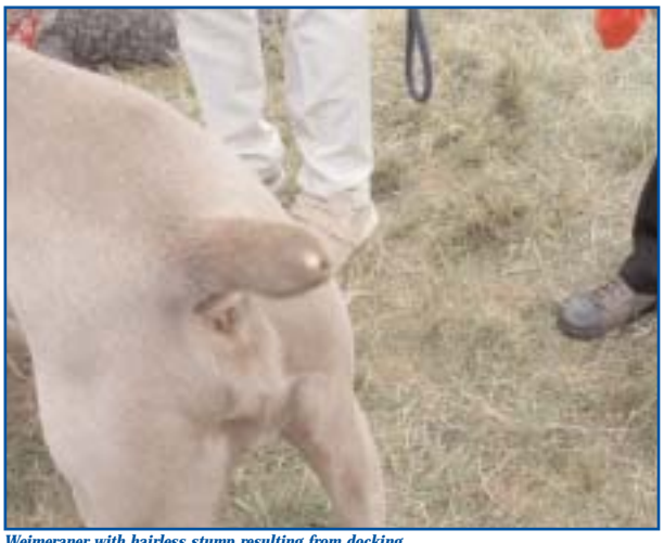
Weimeraner with hairless stump resulting from docking

In humans, amputation is often associated with long-term pain; about one fifth of amputees report attacks from 'phantom limb' pain or from stump pain even two years after amputation. Pain also occurs in a small number of people who experience limb amputation very early in life, suggesting that this may be possible in dogs.<sup>4</sup>