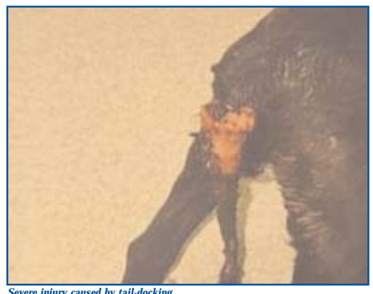
Severe injury caused by tail-docking